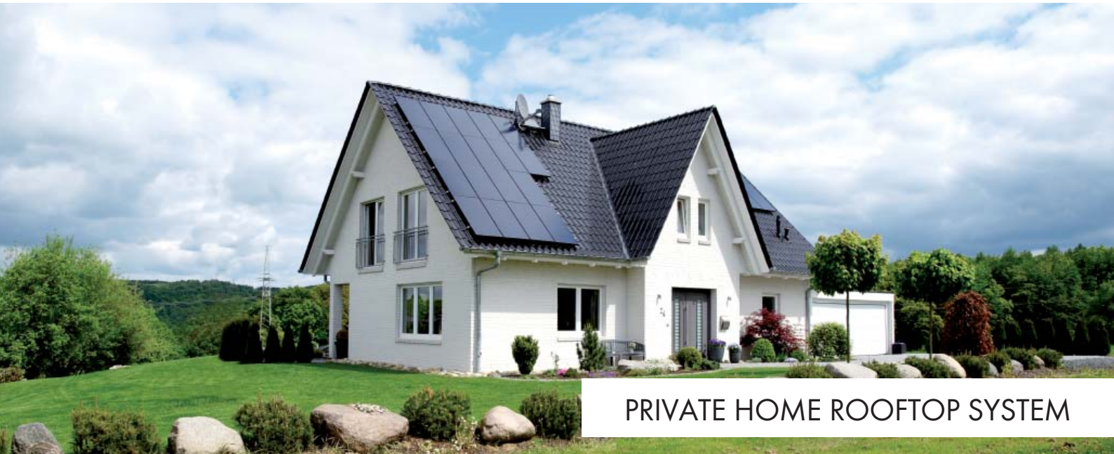
PRIVATE HOME ROOFTOP SYSTEM