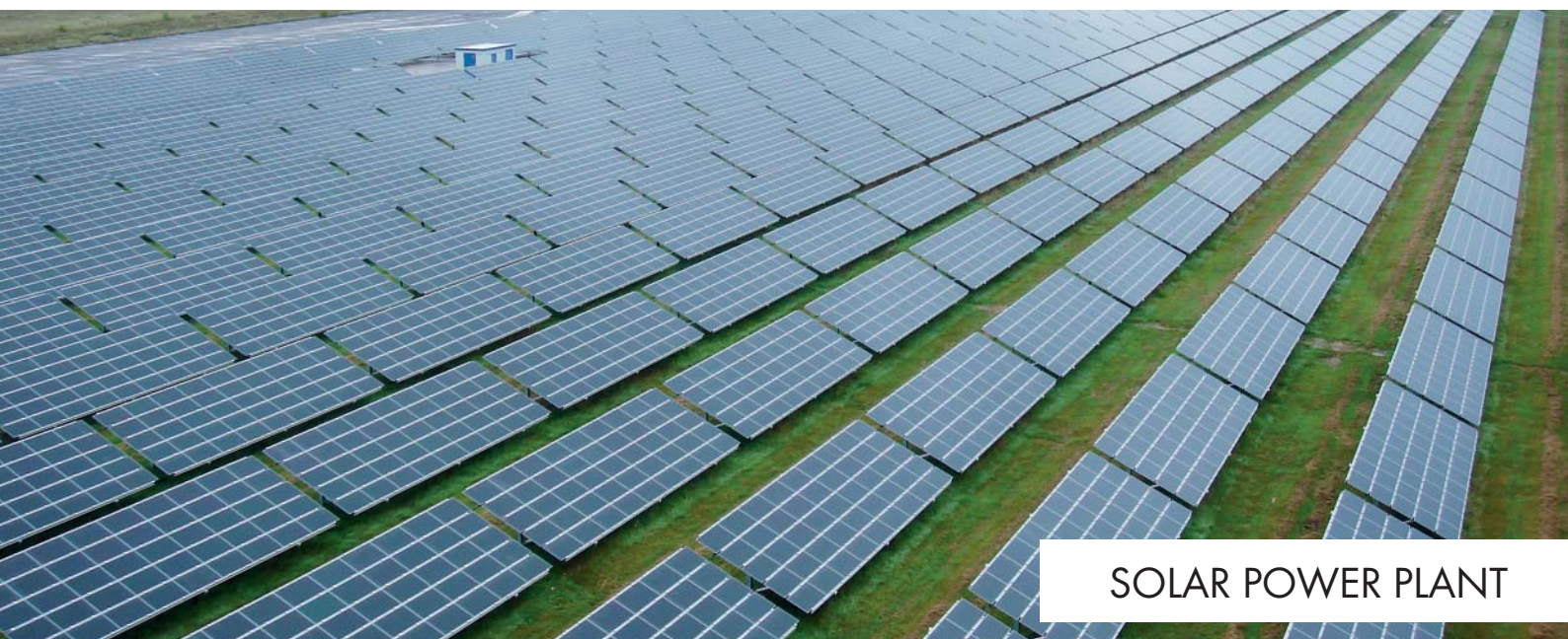
SOLAR POWER PLANT