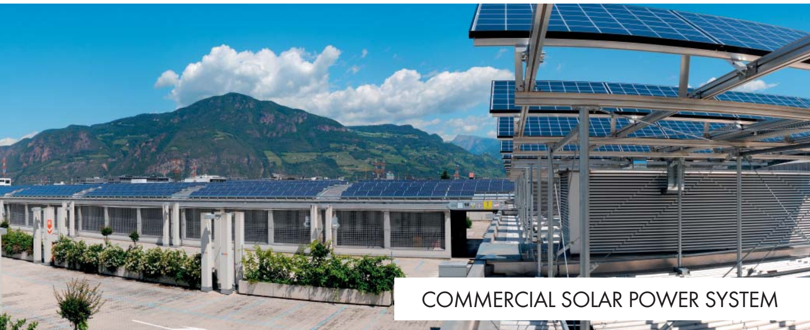
COMMERCIAL SOLAR POWER SYSTEM