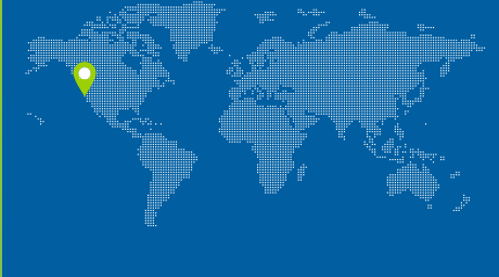
Jenner, CA, USA