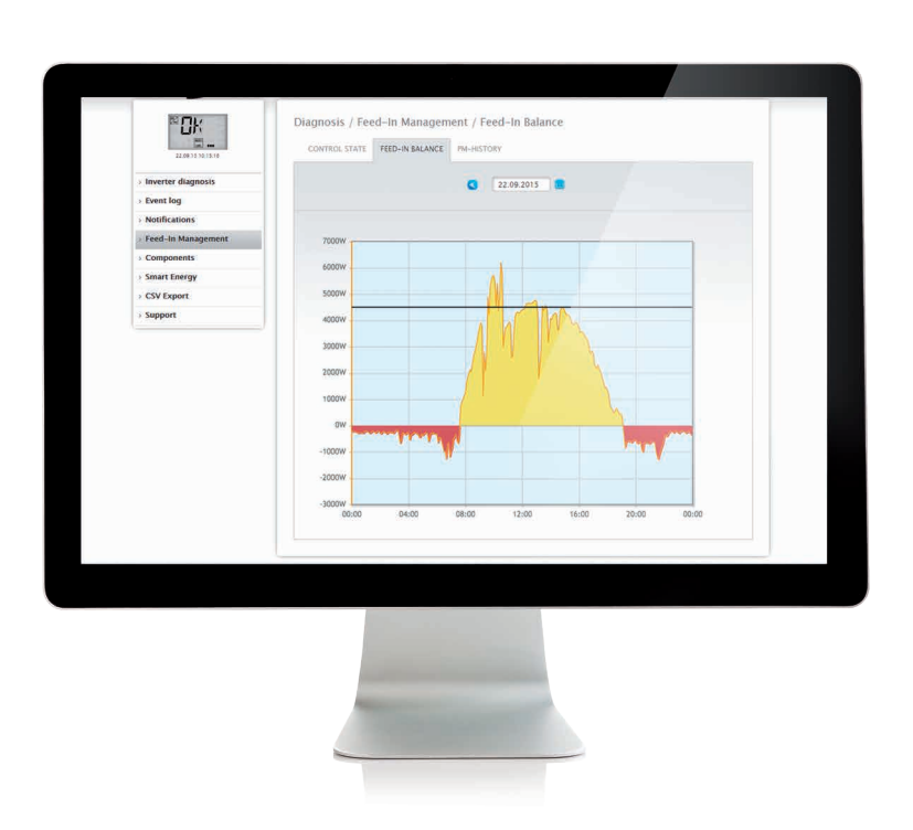
Feed-in management - feed balance: The times when there was a grid feed and when electricity was purchased from the grid can be seen at a glance in this graph. Negative (red) values indicate that electricity was purchased from the grid and positive (yellow) values that there was grid feed.

When used with the Solar-Log WEB Enerest™ XL and either the SCB, the Solar-Log 1900 monitors every single string, ensuring the most complete and secure monitoring for large-scale PV plants with exact error identification and localization.